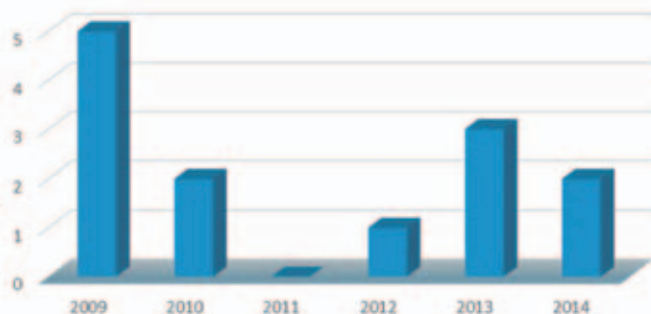
Number of samples containing methylphenidate delivered per year (n=20.333)