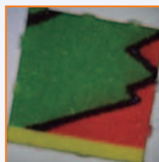
DOB submitted as an LSD blotter

9 out of total 13 samples were presented as blotter.